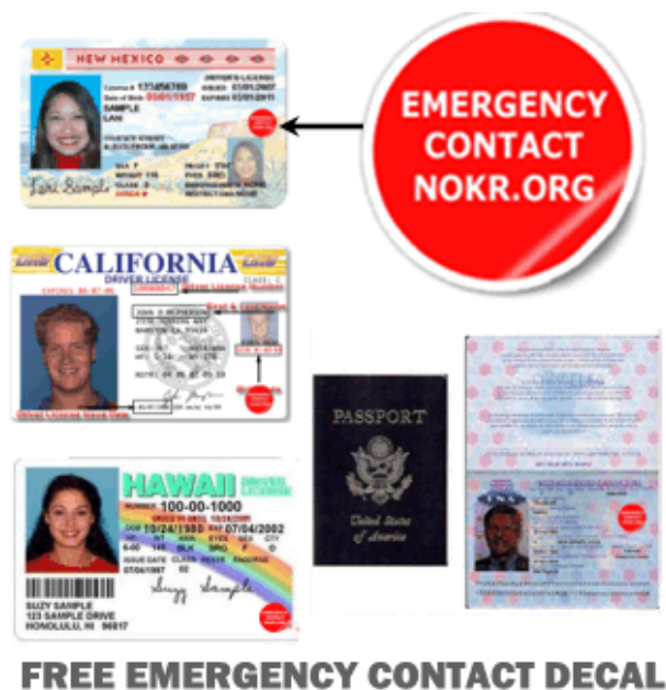
FREE EMERGENCY CONTACT DECAL

NOKR will NEVER ask for any intrusive information like your social security number or date of birth. NOKR does ask for age optionally which is used as a chronological identifier.