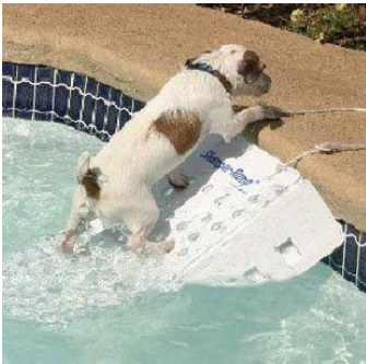
Don't forget the beloved pet!

Canals are very dangerous and should never be a place for swimming!